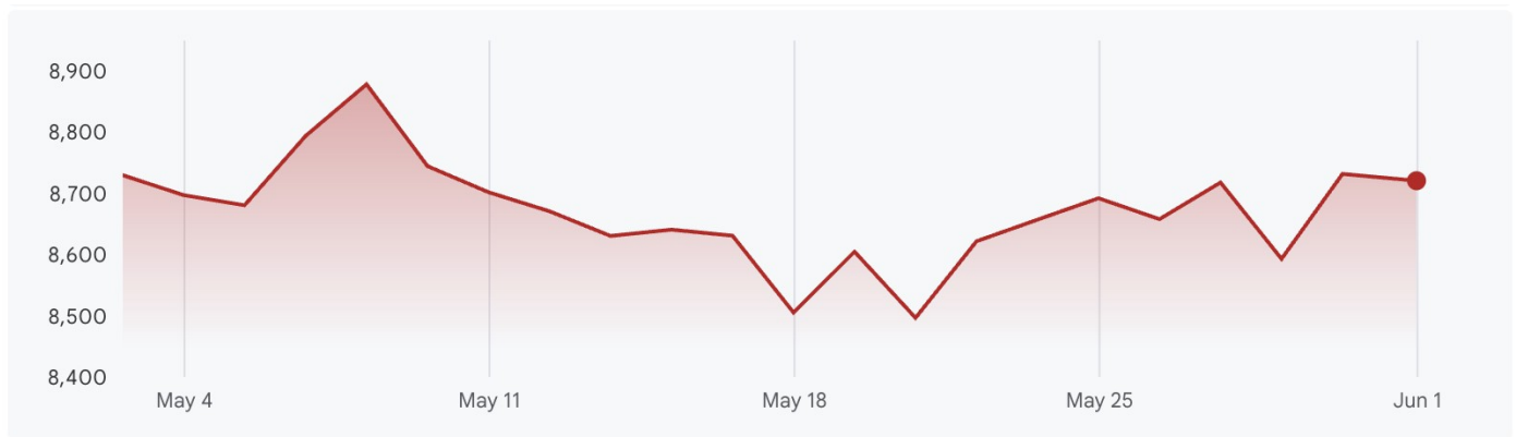
ASX 200 Performance in May 2026 - Google Finance

The Australian equity market endured a highly volatile and ultimately disappointing month. As depicted in the accompanying graph above, the S&P/ASX 200 opened the period near 8,730 points, with the chart tracking the price action through to 1 June. The chart indicates the index ultimately finished the period down 0.19 per cent at 8,713.20. While the market saw a temporary recovery around May 29 where it hovered near 8,731.70, it failed to maintain that momentum as the month wrapped up. The overriding sentiment across the entire period was undoubtedly one of turbulence.