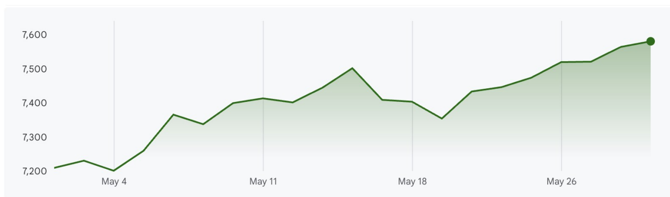
S&P 500 Performance in May 2026 - Google Finance

Turning our attention to the United States, the month of May 2026 was a stellar period for the US equity market, as evidenced by the S&P 500 chart provided in the graph below. Opening the month near 7,200 points, the index experienced a brief dip around May 4. This initial hesitation reflected investor apprehension following the Federal Open Market Committee meeting on April 29.